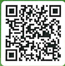
EQ Feed Request