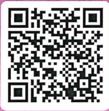
EQ Stall Maintenance Work Order