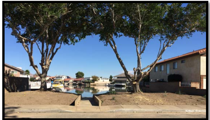
Fishing Area 8 as of 10-21-15