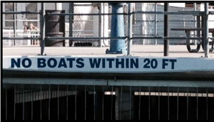
dam after paint