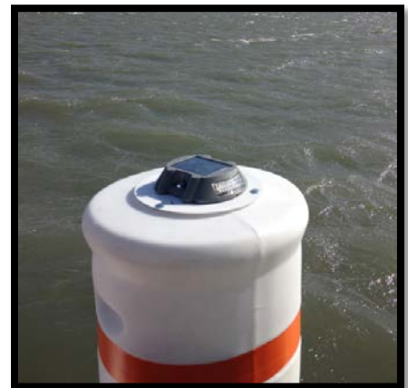
new solar lights