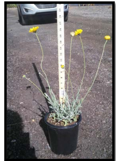
desert marigolds 18" tall