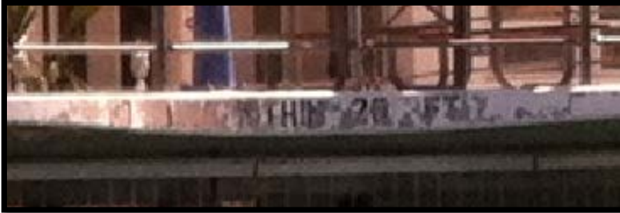
dam before paint