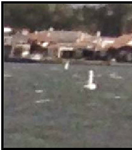
new larger sombrero buoy upright