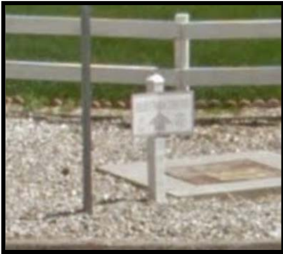
EE Center directional sign before (faded)