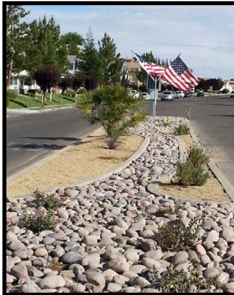
island with flag displayed