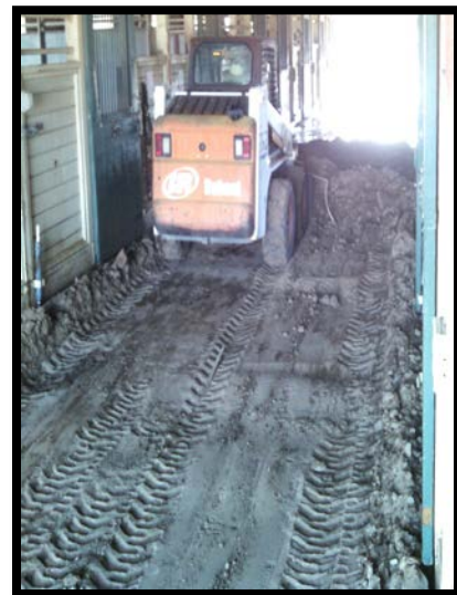
Grading and removing 3"