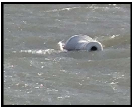
Small sombrero buoy on its side