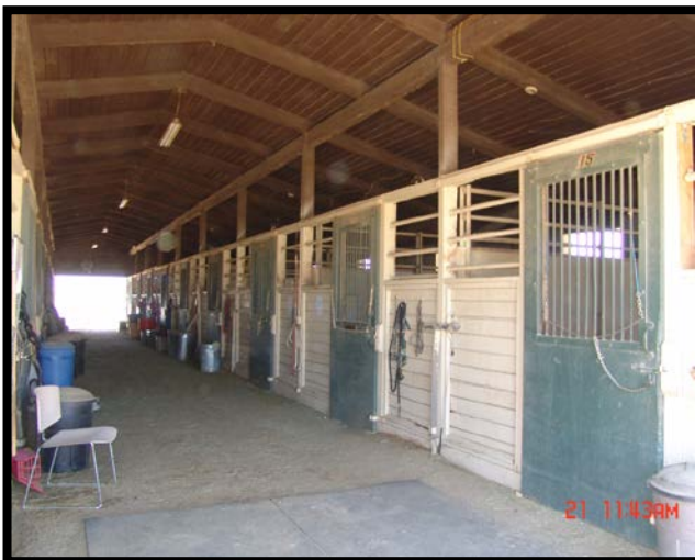
Barn Aisle before construction