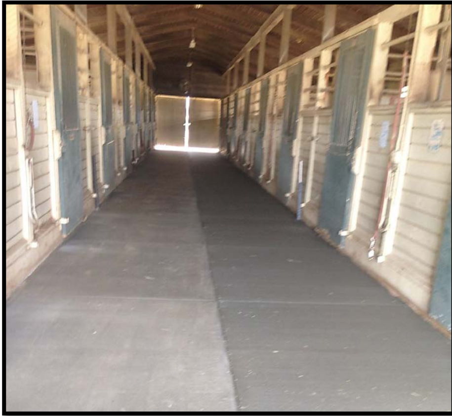
Concrete poured and drying