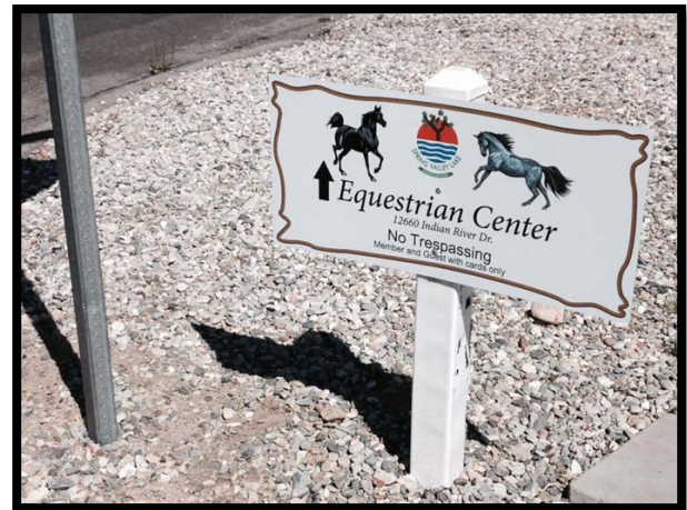
EE Center directional sign before (wow)