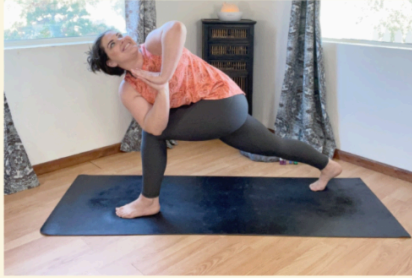
by Mallory Riess

HATHA YOGA RESTORE BALANCE, RELEASE TENSION